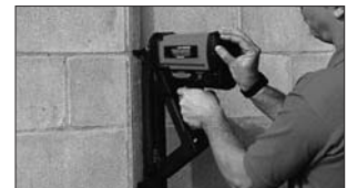
Furring attachment—perfect fastening every time in soft and hard base materials