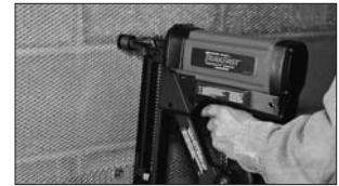
Lath attachment—using one-inch TrakFast discs and magnetic probe adapter (page 25)