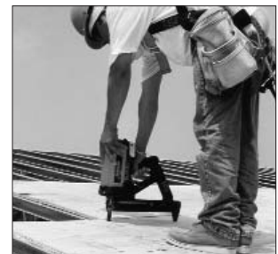
Plywood attachment—using TrakFast plywood to steel pin