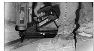
Track to concrete