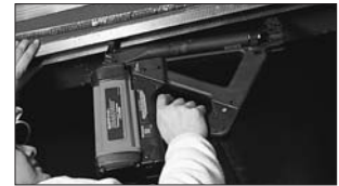
Track to steel

FOR SPECIFIC PIN AND LOAD INFORMATION SEE PAGES 26-27