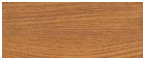
L3024 Melbourne Acacia