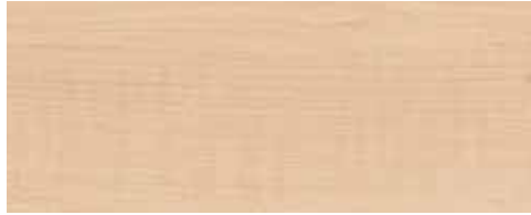
L3054 Canadian Maple