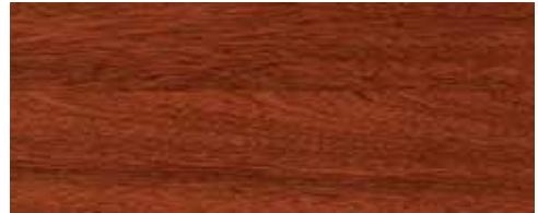
L3023 Brazilian Jatoba