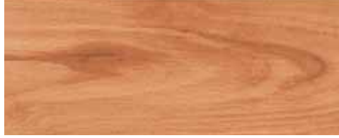
L8718 Tawny Tan Beech