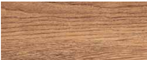
L8713 Natural Oak