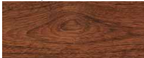
L8711 Toasty Jatoba