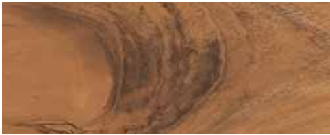
L8710 Mystic Walnut