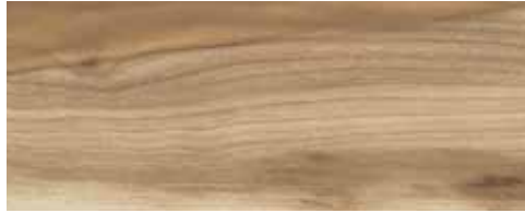
L4002 Flaxen Maple