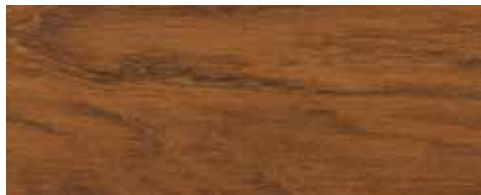
L4003 Sunset Jatoba