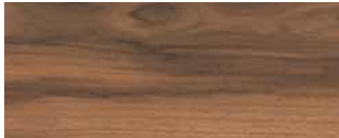
L8719 Toffee Walnut