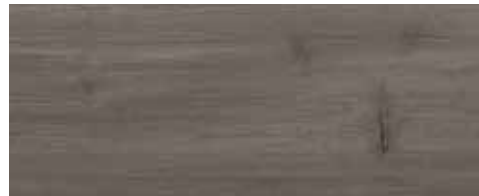
L8702 Adrift Pine