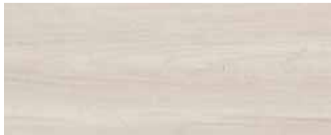
L8703 Blizzard Pine