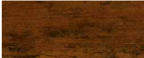
L3021 Cherry Bronze