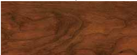
L8714 Ornamental Cherry