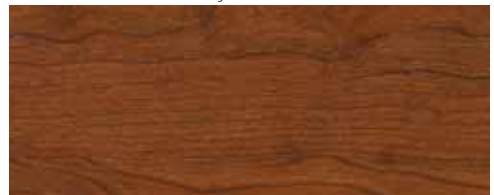
L4000 Native Cherry