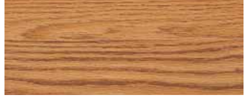
L8715 Butterscotch Oak