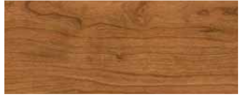
L4001 Sedona Cherry