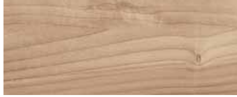
L8709 Desert Tan Maple