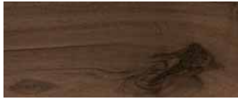
L8705 Tree Branch Walnut