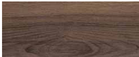
L8708 Exotic Olive Ash