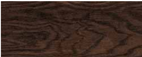
L8707 Forestwood Ash