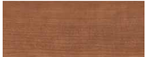
L8717 Earthen Cherry