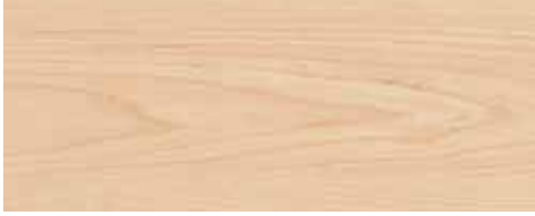
L8712 American Maple