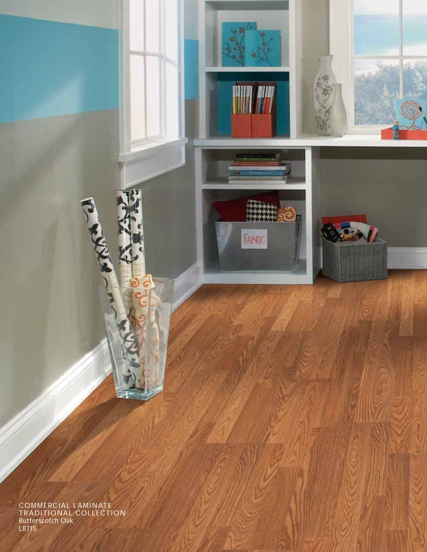
COMMERCIAL LAMINATE TRADITIONAL COLLECTION Butterscotch Oak L8715