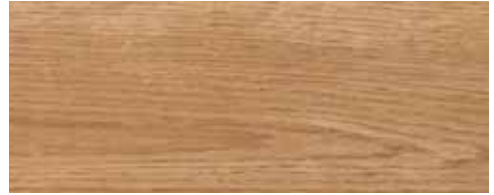
L3056 Southern Hickory