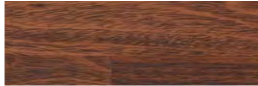
Merbau Antique L0118