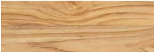
Pecan Natural L0117

Express your individual style with this collection created with realistic textures and colors that make it easy to live your own American dream.