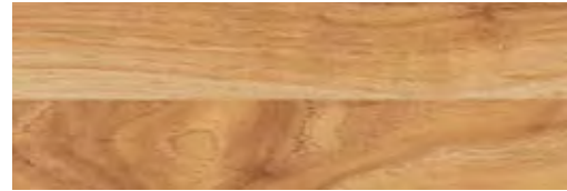
Pecan Amber L0116