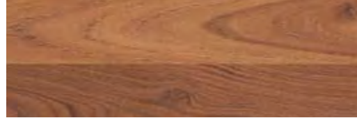
Acacia Sonora L0113