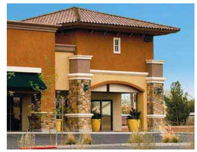
Product shown: Ledgestone Glacier Valley