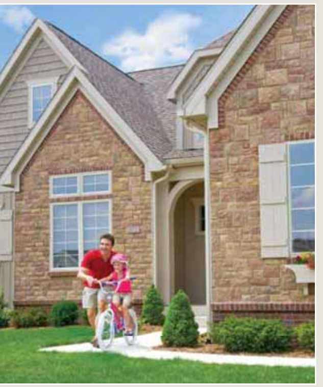
Product shown: Tuscan Cobble Vintage Wine

ProStone® manufactured stone veneers meet AC-51 criteria, the strictest requirements in the industry.