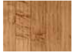
MAPLE Sunset Sand EL5MAI2SSLG 5"