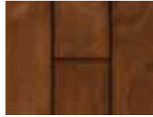
SAPELE Natural ERG7003