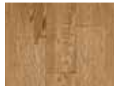
OAK Naturally Aged EPH6410 6"