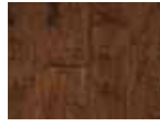
MAPLE Spice Chest ERH5306 5"