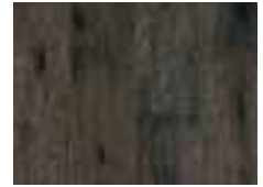
HICKORY Misty Gray ERH5303 5"