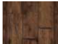
MAPLE Timeless Cobbler EPH6404 6"