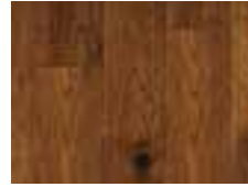
HICKORY Classical Antiquity EPH6400 6"