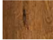
HICKORY Light Chestnut ERH5300 5"