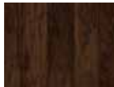
WALNUT Morning Coffee GCW484MCLG 5"