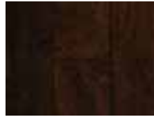
SAPELE Roasted Bean ERG7002