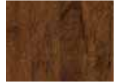
HICKORY Fall Canyon ERH5301 5"