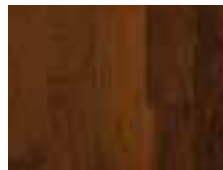
WALNUT Tosted Wheat GCW252TWLG 3" GCW452TWLG 5"