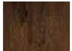
OAK Vintage World EPH6411 6"

25-Year Residential Warranty Engineered Hardwood