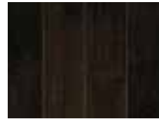
MAPLE Rich Brown ERH5308 5"