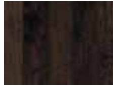
OAK Tudor Brown 755TB 5"