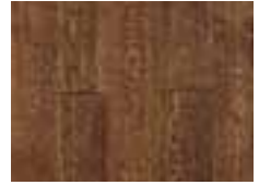
OAK Antique Brown 755AB 5"