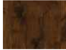
WALNUT Amber Tuscan Tree EPH6406 6"