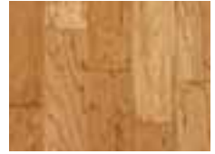
CHERRY Natural GCC252NALG 3" GCC452NALG 5"