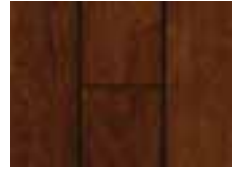
SAPELE Exotic Spice ERG7000