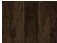
WALNUT Fallen Leaf GCW484FLLG 5"

25-Year Residential Warranty 3-Year Commercial Warranty* Engineered Hardwood