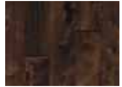
BIRCH Coventry Brown 765CB 5"

25-Year Residential Warranty Solid Hardwood