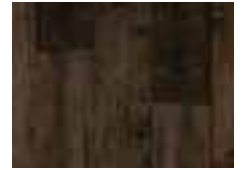
MAPLE Enchanted Evening EPH6403 6"