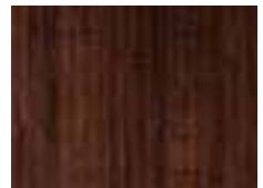
MAPLE Red Dusk EL5MAI2RDLG 5"