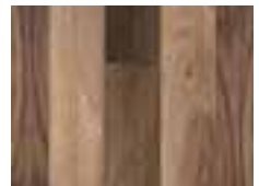
WALNUT Summer White GCW484SWLG 5"