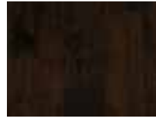
WALNUT Festival Noir EPH6408 6"