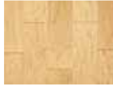
MAPLE Antique Cashew GCM452ACLG 5"