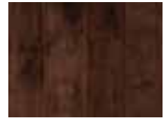
MAPLE Burnt Cinnamon ERH5307 5"