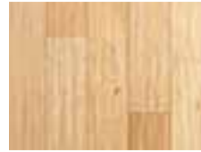
MAPLE Sunshine EL5MAI2SNLG 5"