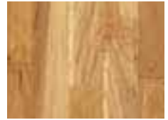
HICKORY Natural GCH452NALG 5"