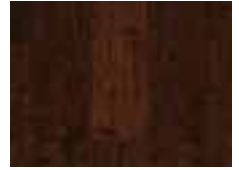
WALNUT Mediterranean Rustique EPH6407 6"