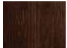
OAK Smoke EL5W0H5MLG 5"

25-Year Residential Warranty Engineered Hardwood