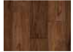
HICKORY Old World Bronze EPH6401 6"