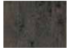
MAPLE Silver Shade ERH5309 5"

25-Year Residential Warranty Engineered Hardwood