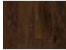
HICKORY Deep Java ERH5302 5"