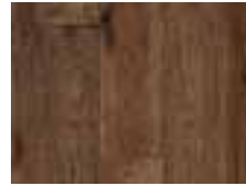
HICKORY Woodland Chateau EPH6402 6"