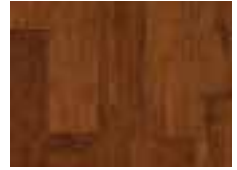
MAPLE Burnt Almond GCM452BALG 5"