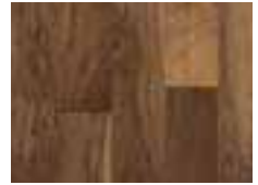
WALNUT Autumn Dusk GCW252ADLG 3" GCW452ADLG 5"