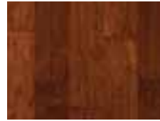
CHERRY Bronze GCC452BZLG 5"