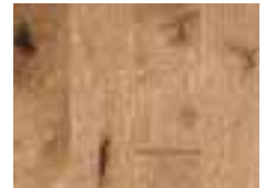
MAPLE Desert Wood ERH5305 5"