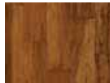
HICKORY Honey Butter GCH452HOLG 5"