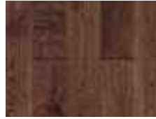
OAK Vintage Brown 755VB 5"