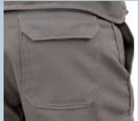
Hip Pockets - 6" h x 6" w