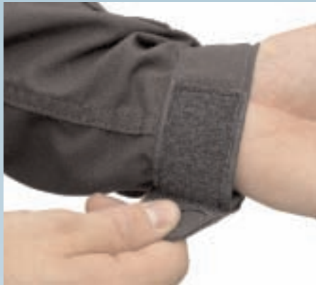
Velcro® Wrist Closures