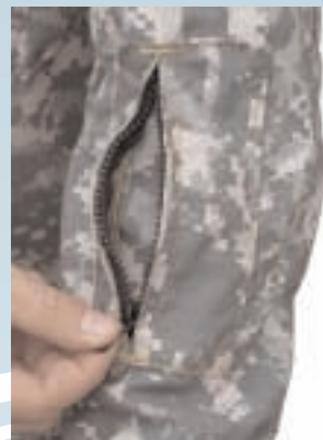
Vertical Zippered Slot Pocket 6" h x 2" w or 6" h x 4" w