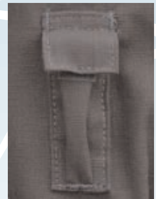
Knife Pouch 4" h x 1.5" w

Contact us for quotes on any other required customizations