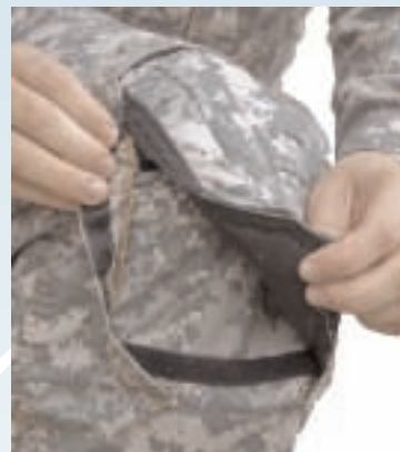
Removable BiFlex Knees