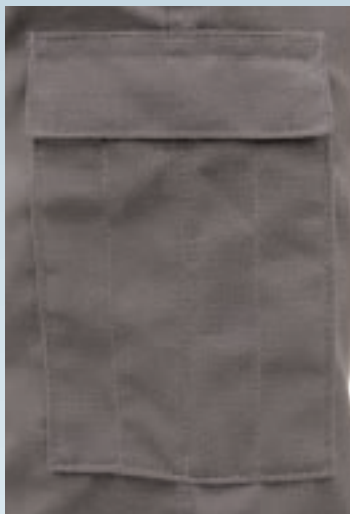
Patch Pocket with 3 Equipment Dividers 6" h x 8" w