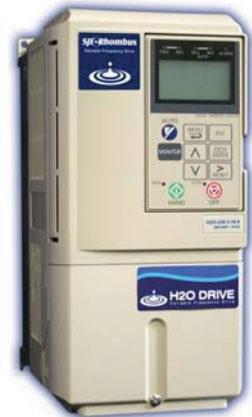
H2O Drive® VFD