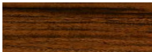
Ironwood Natural L3016