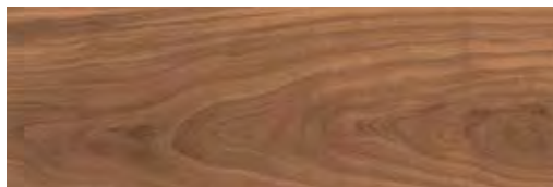
Fruitwood Select L3044

This elegant collection captures the sophisticated look of exotic hardwoods. For standout style and a decorating choice that says, "You've arrived."