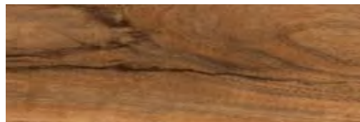
Exotic Walnut L3020