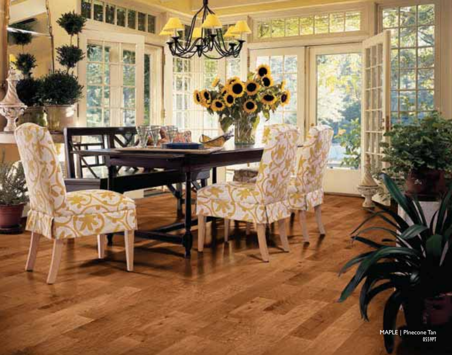
MAPLE | Pinecone Tan 0559PT