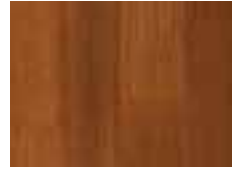
BRAZILIAN CHERRY Natural EGE3101 3-1/4" EGE6101 6-1/2"