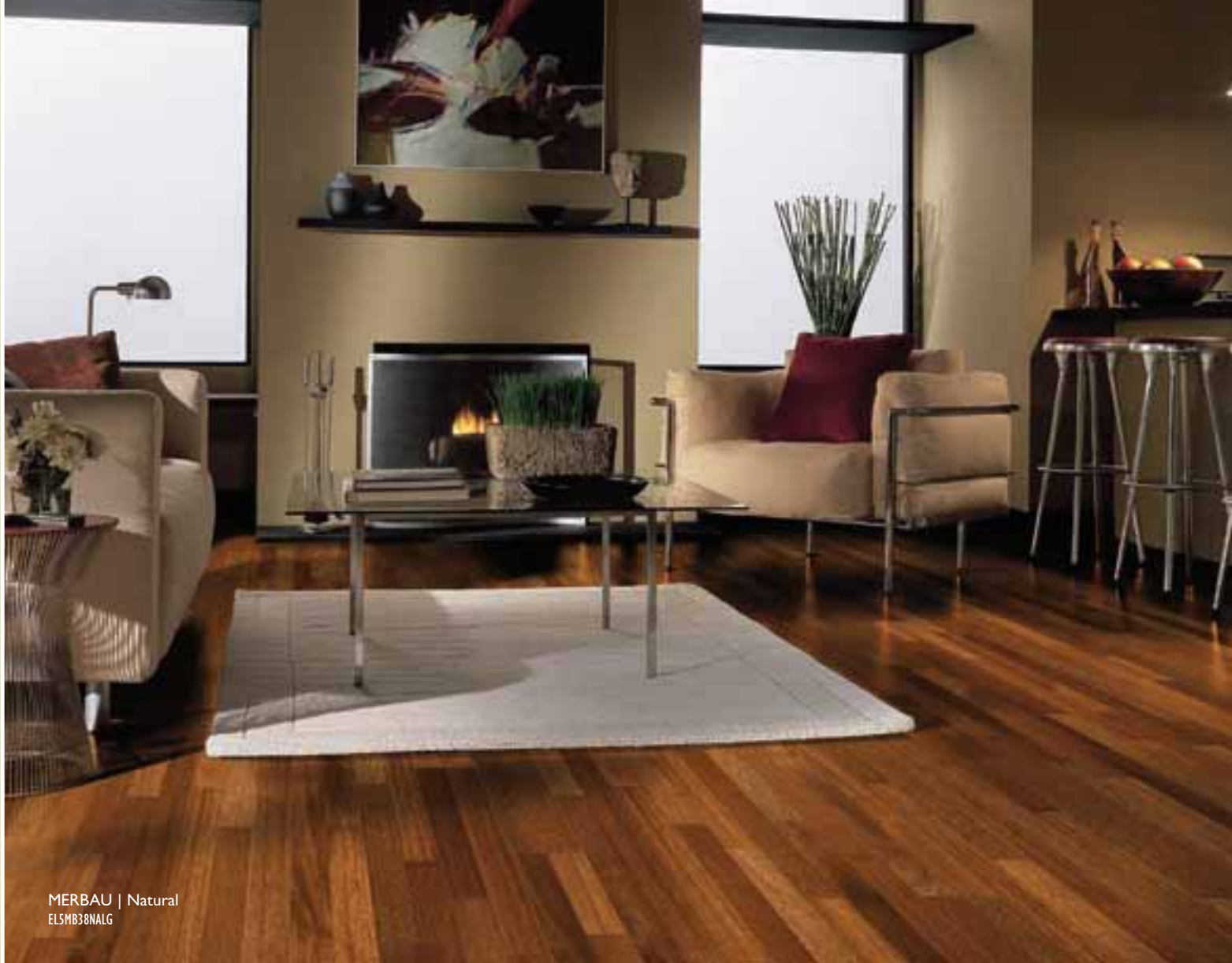
MERBAU | Natural EL5MB38NALG