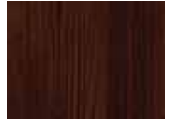
AFRICAN MAHOGANY Burnished Sable EGE3206 3-1/2" EGE4206 4-3/4"