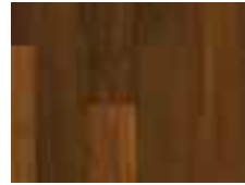
LAPACHO Natural C5061LLG 3"