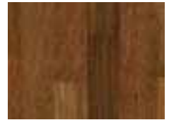
SUCUPIRA Natural C5081SLG 3"