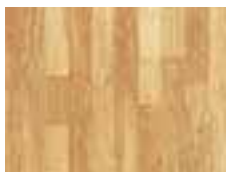
KONA Natural EL5HV38NALG