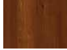
SANTOS MAHOGANY Natural EGE3102 3-1/4" EGE6102 6-1/2"