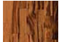
TIGERWOOD Natural TG422NA E 3-1/2" TG462NA S 3-1/2"