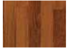
BRAZILIAN CHERRY Natural EGE3203 3-1/2" EGE4203 4-3/4"