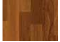
CUMARU Natural C5051CLG 3"