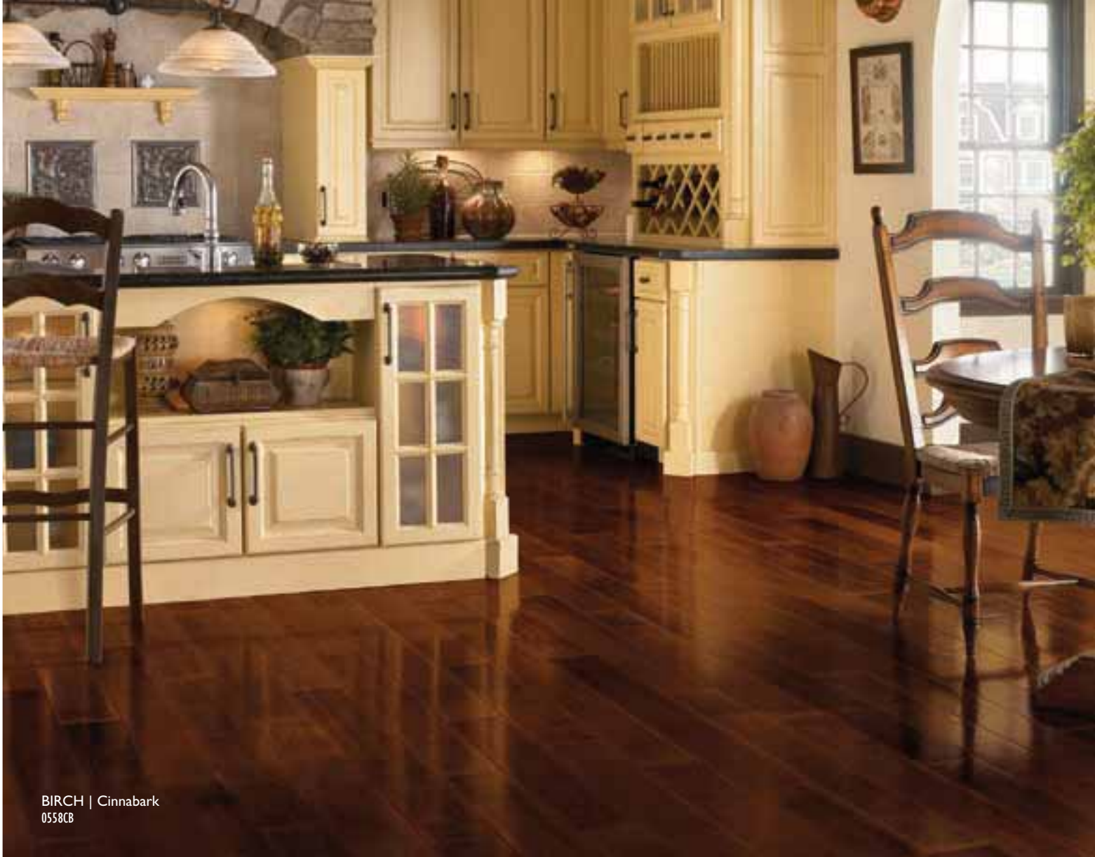
BIRCH | Cinnabark 0558CB