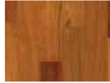
BRAZILIAN CHERRY Natural C5048JLG 3"