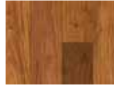
AMENDOIM Natural EGE3100 3-1/4" EGE6100 6-1/2"