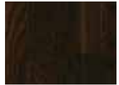
ASH Nile Shade Tree EEF5307 5-1/4"

25-Year Residential Warranty Engineered Hardwood