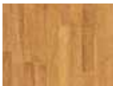
KONA Hazel EL5HV38HZLG