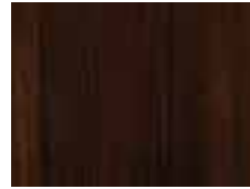
AFRICAN MAHOGANY Exotic Shadow EGE3205 3-1/2" EGE4205 4-3/4"