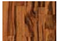
TIGERWOOD Natural EGE3200 3-1/2" EGE4200 4-3/4"