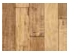
MAPLE Country Natural 0559CN