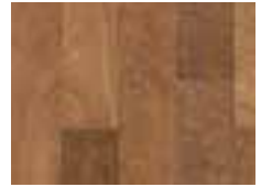
BIRCH Madagascar Magnolia EEF5303 5-1/4"