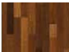
MERBAU Natural EL5MB38NALG