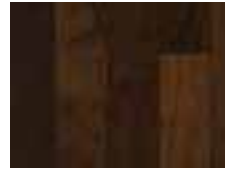
MAPLE Banyan Mahogany EEF5302 5-1/4"