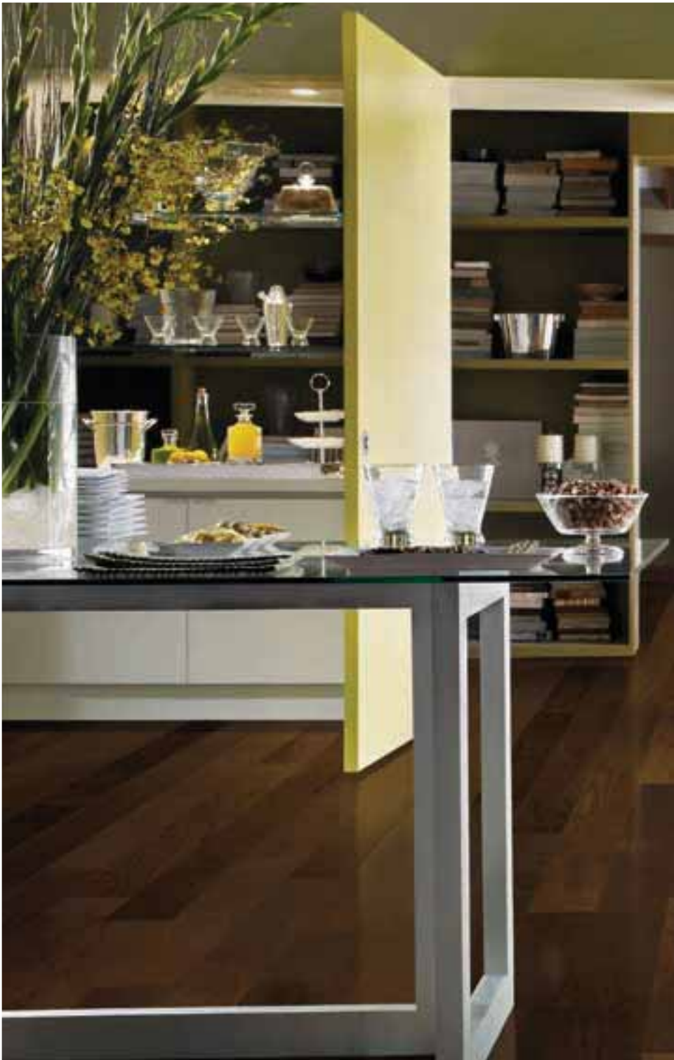
Exotic Fusion™ MOUNTAIN ELM | Bali Heritage EEFS305