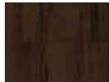
TIGERWOOD Brazilia Taupe EGE3201 3-1/2" EGE4201 4-3/4"

15-Year Residential Warranty Engineered Hardwood