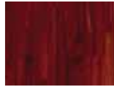
BRAZILIAN RUBY IRONWOOD Natural BR422NA E 3-1/2"

25-Year Residential Warranty Solid Hardwood