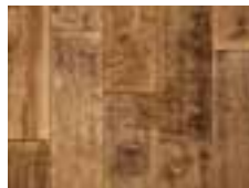
BIRCH Natural 0558NA 5"