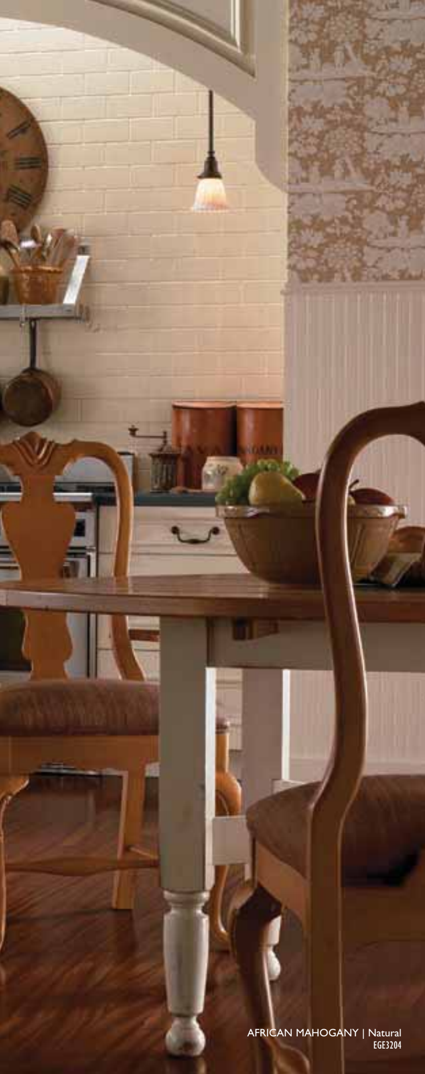
AFRICAN MAHOGANY | Natural EGE3204