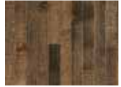
OAK Aged Oak SBC2101 2-1/4"