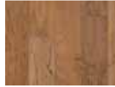
MAPLE Olivewood Harvest EEF5300 5-1/4"