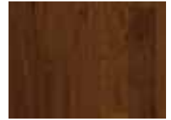
LAPACHO Natural LA422NA E 3-1/2" LA462NA S 3-1/2"