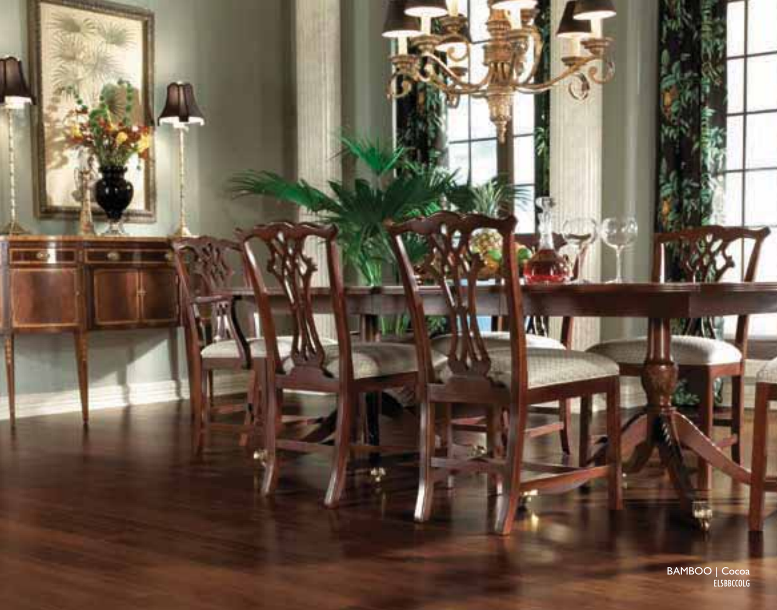
BAMBOO | Cocoa ELSBBCCOLG