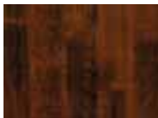
CHERRY Amberwood 0557AW 5"