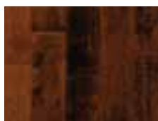
MAPLE Raisin 0559RA