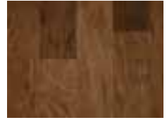
MAPLE Cypress Grove EEF5301 5-1/4"