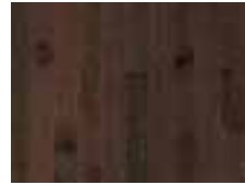
OAK Winemaker Harvest SBC2102 2-1/4"

25-Year Residential Warranty 3-Year Commercial Warranty Solid Hardwood