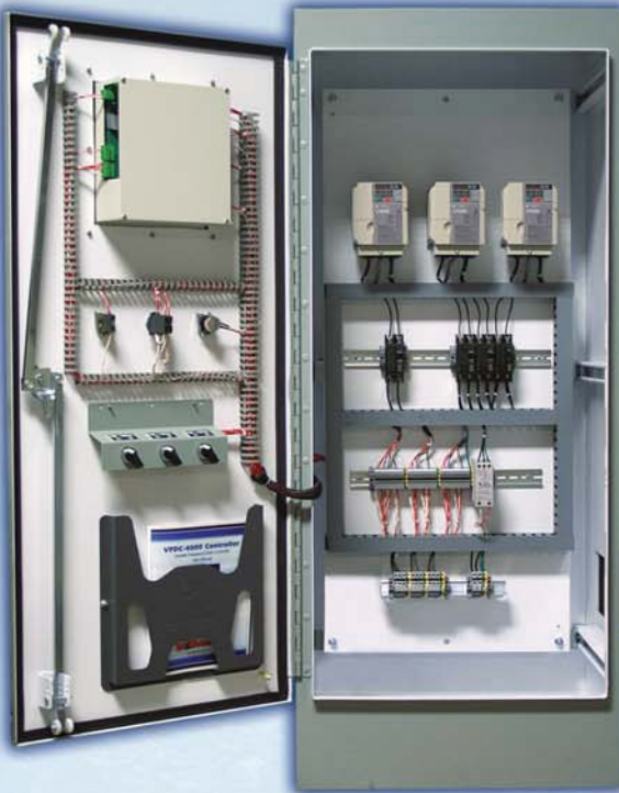
Free Standing Enclosure [optional]