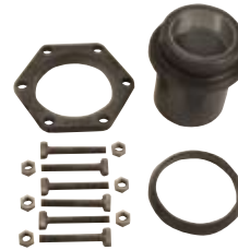
DIPS Fittings MJ Adapter (Mechanical Joint Adapter)

The MJ Adapter Kit consist of: HDPE MJ Adapter with metal insert, Metal Gland, Gasket, and attachment Bolts and Nuts.