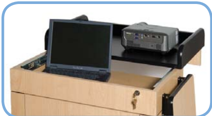
Top Slides Back For Storage