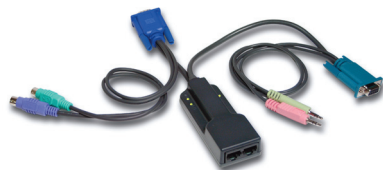
ECMS1000 Extender and AMIQ Module