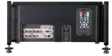
TITAN 1080p-700 side panel