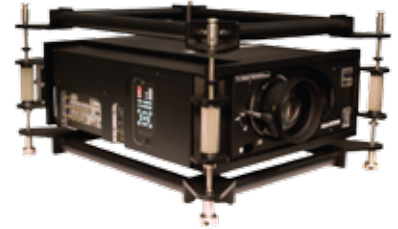
shown with optional rigging frame