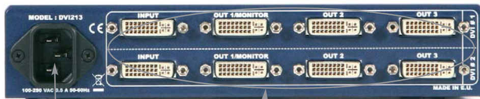
Standard IEC international power connector