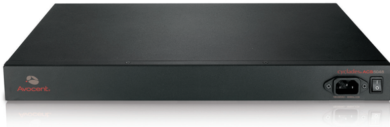
ACS 5048 Advanced Console Server