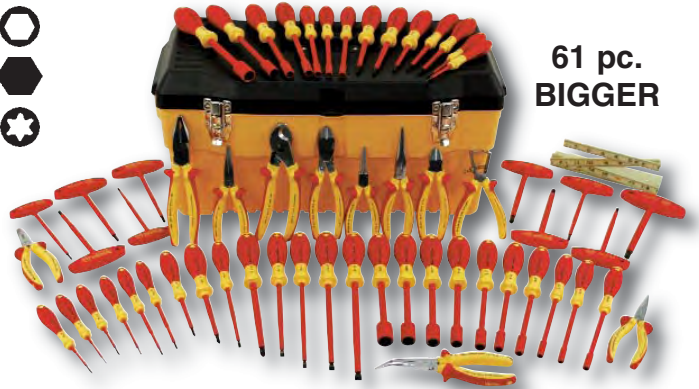
61 pc. BIGGER