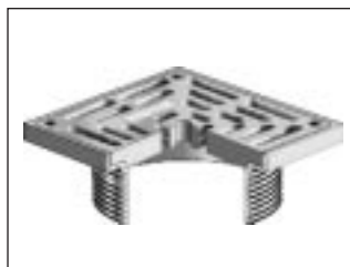
XS (STRAINER SIZE) -1