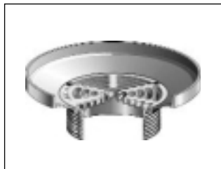
ER STRAINER (SPECIFY SIZE, FINISH)