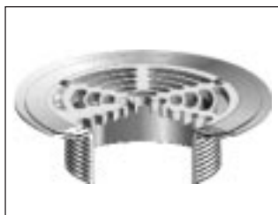
FC (specify size) -1