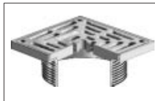
XS (STRAINER SIZE) -1