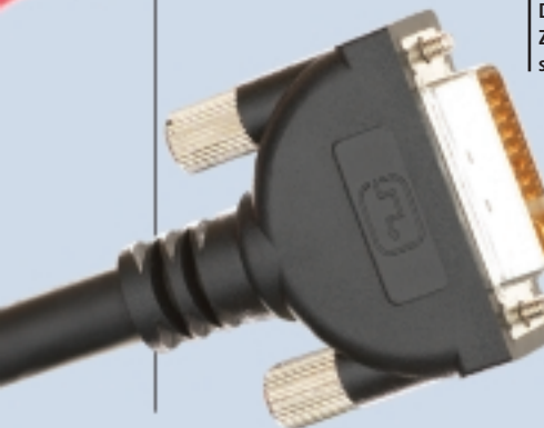
DVI option Z400DVI-D/DL shown