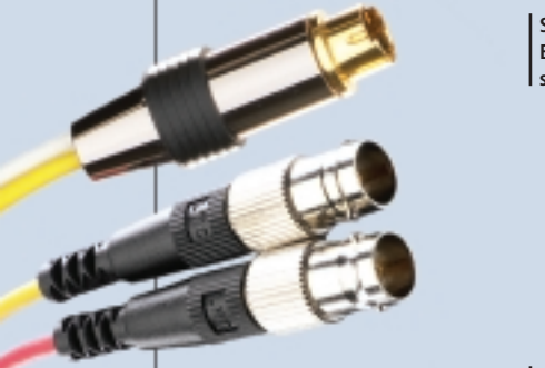
S-VIDEO option E-SVM-2BNCM shown