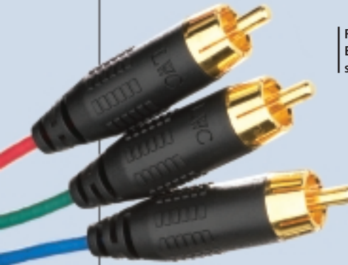
RGB option E-3RCAM-M shown