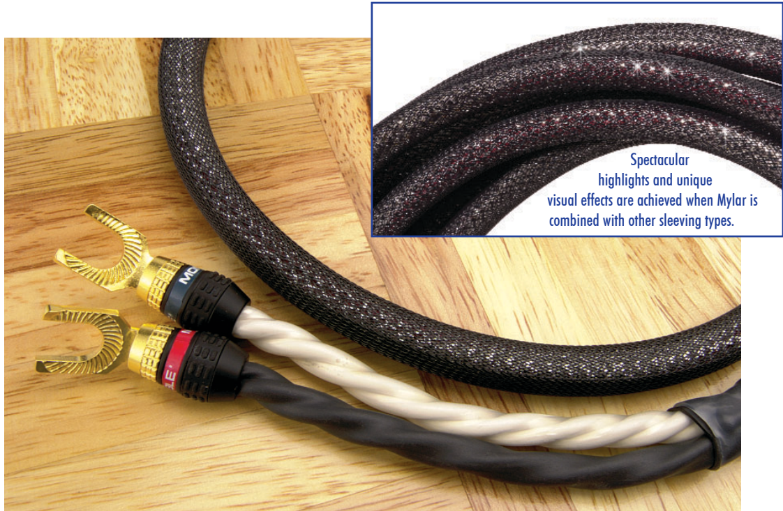
Spectacular highlights and unique visual effects are achieved when Mylar is combined with other sleeving types.