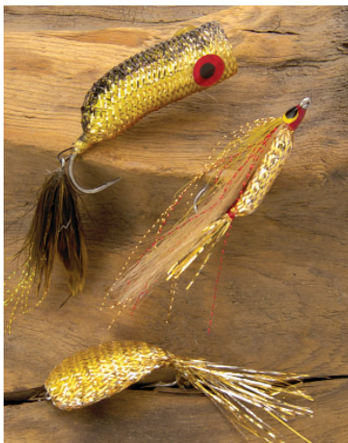
Light weight and economy make MY an ideal product for designing and tying fishing lures of all types and sizes. Several world records have been set with lures constructed with Techflex sleeving.