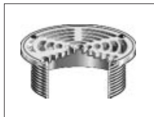
STANDARD (STRAINER SIZE) -1