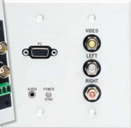
Part #: PCA3-2C-100P