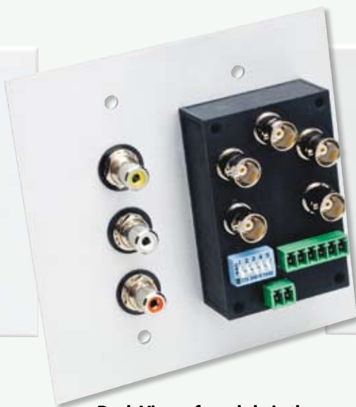
Back View of module is the same for both plates.