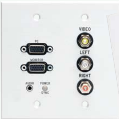
Part #: PCA2-2C-100P