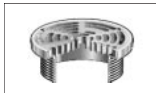
X (STRAINER SIZE) -1