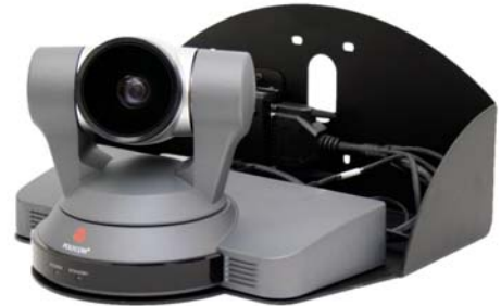
Figure 1: WallVIEW PRO EagleEye 1080 HD System with EagleEye 1080 HD camera (not included), EZIM and Wall Mount

The WallVIEW PRO EagleEye 1080 HD has many new features including a four position distance adjustment for CAT-5 cabling, Y-Gain adjustment for cable length compensation, IR forwarding, 1-RU rack mount QCP interface and the small EZIM, which is intended to be paired with the Polycom EagleEye 1080 HD PTZ camera provided with the Polycom HDX codecs. Like all Vaddio WallVIEW systems, it comes with the Thin Profile Wall Mount and mounting hardware.