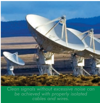
Clean signals without excessive noise can be achieved with properly isolated cables and wires.

CN utilizes a patented carbonization process which infuses our braided sleeving with a microscopic carbon compound that is virtually indistinguishable from the base material. The result is a strong, long lasting jacket that is ready for the most sensitive applications.