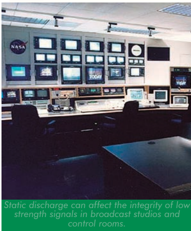
Static discharge can affect the integrity of low strength signals in broadcast studios and control rooms.