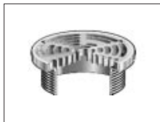
X (STRAINER SIZE) -1