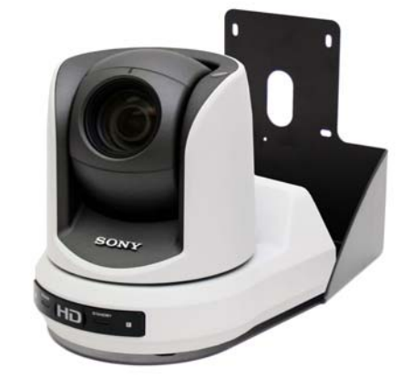
Figure 1: (top) Quick-Connect CCU 1 RU rack mount interface; (bottom) WallVIEW PRO Z330 System with Camera, EZIM and Wall Mount

The WallVIEW CCU Z330 uses high speed differential signaling (HSDS), an active video transmission system, to deliver high quality HD and SD video over standard Cat. 5 cabling. Adjustments allow the video to be extended up to 500 feet from the Quick-Connect CCU with virtually no loss in video quality.