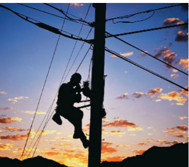
HW is ideal for protecting exposed overhead wires from damage caused by UV, snow & ice and rodents.