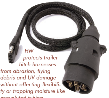
HW protects trailer hitch harnesses from abrasion, flying debris and UV damage without affecting flexibility or trapping moisture like convoluted tubing.

HW is the perfect solution for use on chains and cables to protect painted or laminated surfaces from scuffing and wear.