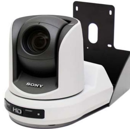
Figure 1: WallVIEW PRO Z330 System with Camera, EZIM and Wall Mount

Overall, the WallVIEW PRO Z330 is superb for a wide range of high definition shooting applications. It is also highly suitable for applications in which images are displayed on large-screen displays, such as in houses of worship, in auditoriums of teaching hospitals, in corporate boardrooms, at sporting events, tradeshows or concerts and for distance-learning applications in which clear, high definition images are required.