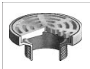
N (specify 7" or 9")