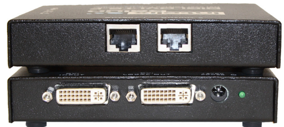
DIGI-DVIT2R-F Send Balun Front and Read

*Distances may be affected by cable grade, cable quality, source and destination equipment, RF and electrical interference, and cable patches. Intelix specifications are based on straight-through cabling with shielded Cat 6.