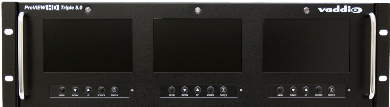
Figure 3: Front panel of PreVIEW HD Triple 5.0 LCD monitors