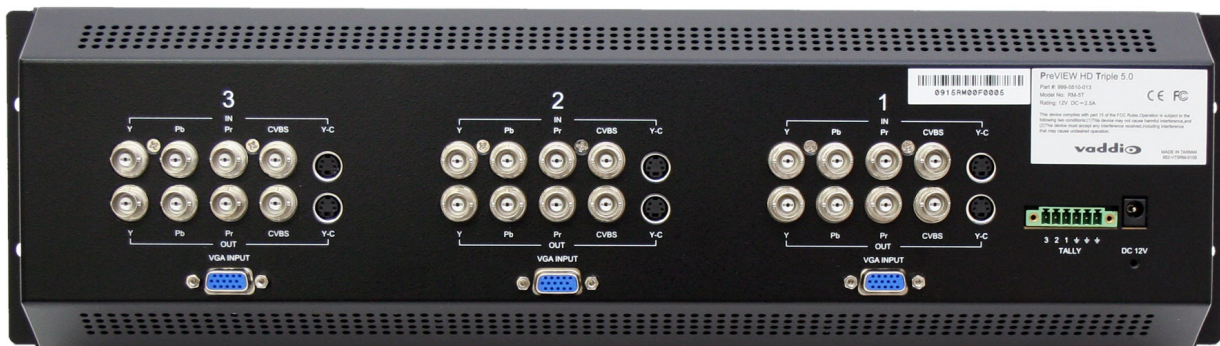
Figure 2: Back panel of PreVIEW HD Triple 5.0, showing the input, output, tally and power connections