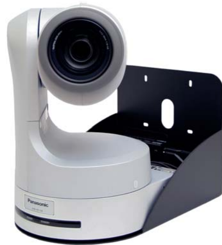
Figure 1: Quick-Connect CCU (top) 1-RU rack mount interface; (bottom) WallVIEW CCU HE100 System with AW-HE100 Camera, EZIM CCU and Wall Mount

The WallVIEW CCU HE100 is superb for a wide range of high definition shooting applications. It is also highly suitable for applications where adjusting the color and brightness levels of one or multiple cameras is critical, such as houses of worship, corporate boardrooms, live event production and distance-learning applications.