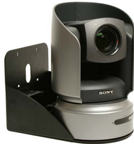
Figure 1: WallVIEW PRO H700 System with Camera, EZIM and Wall Mount

Overall, the WallVIEW PRO H700 is superb for a wide range of high definition shooting applications. It is also highly suitable for applications in which images are displayed on large-screen displays, such as in houses of worship, in auditoriums of teaching hospitals, in corporate boardrooms, at sporting events, tradeshows or concerts and for distance-learning applications in which clear, high definition images are required.