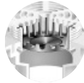
Sediment Bucket (AI-MB-CL)