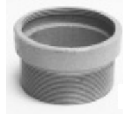
DD-50 Adjustable Extension (DD-50-CL)