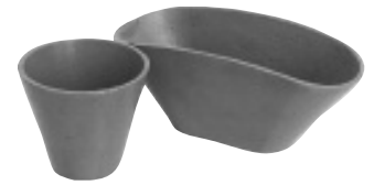
F4-50-CL and G-50-CL