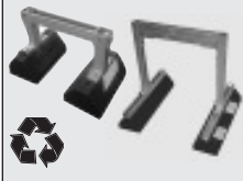
CES-SERIES (MEDIUM LOAD) & CESH-SERIES (HEAVY LOAD)