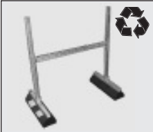
DSA-DUCT SUPPORT SERIES