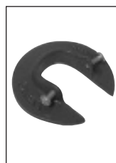
HY-HO1 (wall clamp)