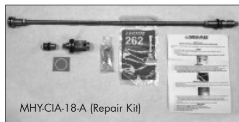
MHY-CIA-18-A (Repair Kit)

All sales subject to MIFAB's terms and warranties. Please refer to inside front cover.