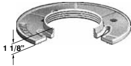
"-C" MEMBRANE CLAMP