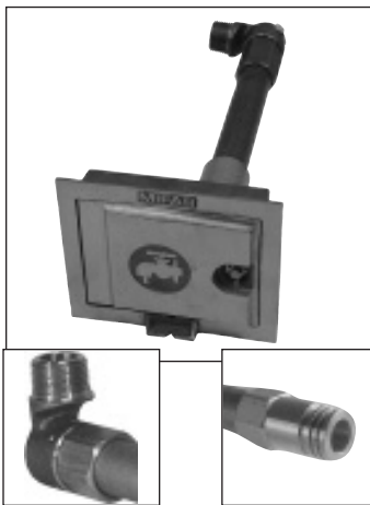
360° swivel inlet 3/4" SWT. inlet