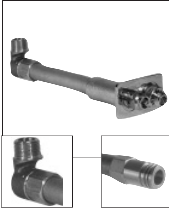
360° swivel inlet 3/4" SWT. inlet