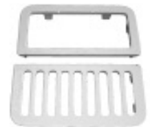
-SPL (split grate)

All sales subject to MIFAB's terms and warranties. Please refer to inside front cover.