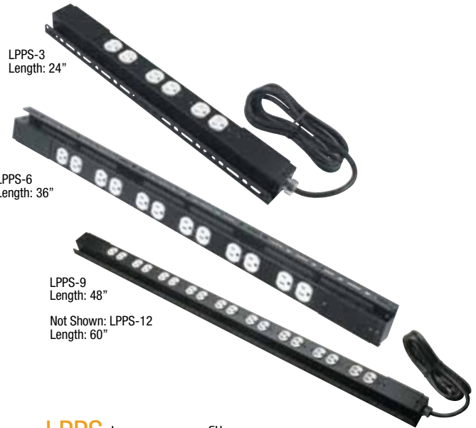
Not Shown: LPPS-12 Length: 60"