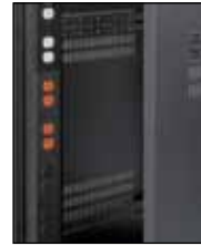
LPPS-3 Length: 24"