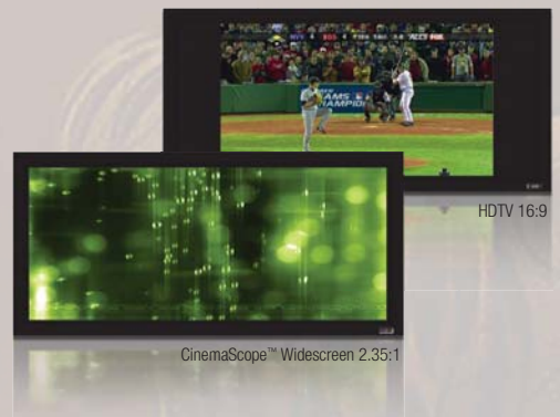
CinemaScope™ Widescreen 2.35:1