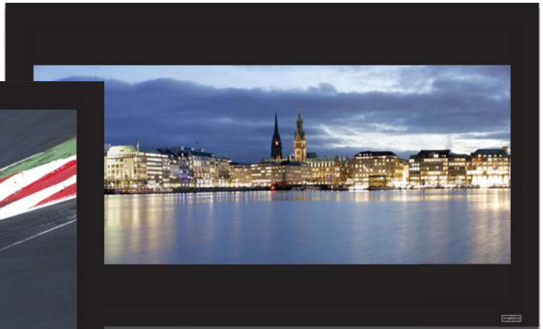
CinemaScope™ Widescreen 2.35:1