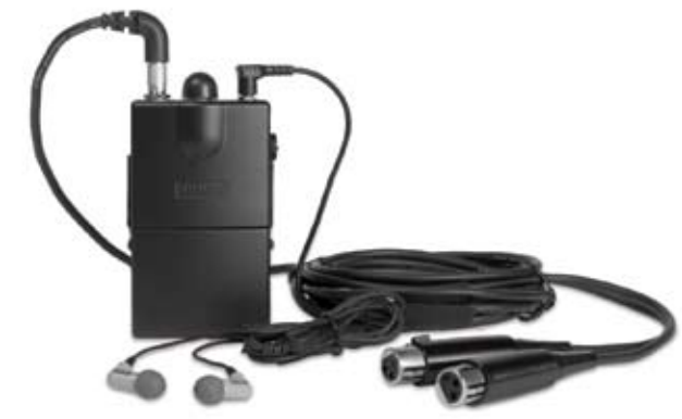
Wired system pictured. Wireless available

Wired/Wireless - 2 Selectable UHF Frequencies - 10 Transmitters Operate Simultaneously