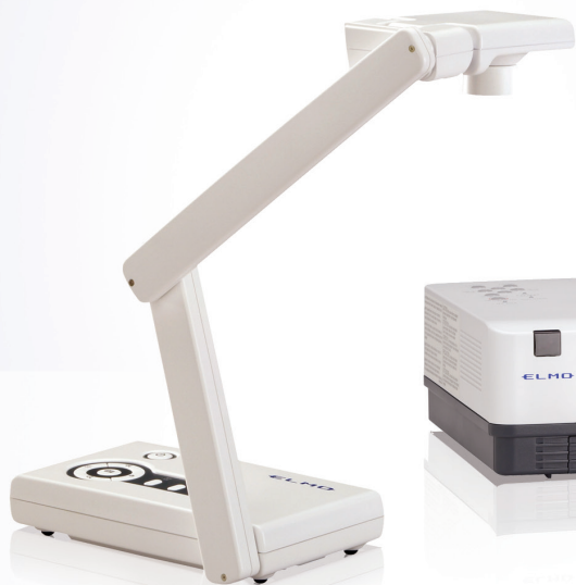
CO-10 Document Camera