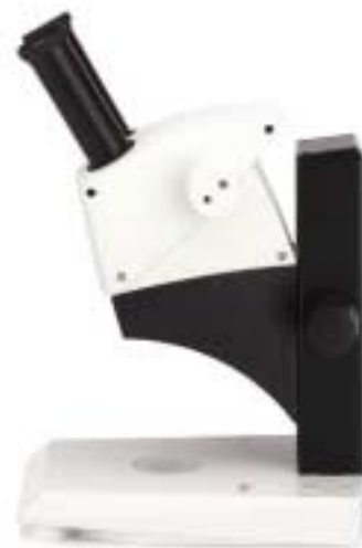
EZ4 Model Shown

Renowned for quality, the E-Series microscopes are affordable, rugged and dependable. All models feature plug and play design, no removable parts, "tool free" tension adjustment, 100 mm working distance, Leica exclusive 50-75 mm Interpupillary distance, student-proof design, built-in 25,000 hour 6500 K, sealed stage plate, true daylight, constant-color temperature power LED illumination for BOTH reflected and transmitted light, built-in universal stabilizing power supply 100-240V and dust cover.