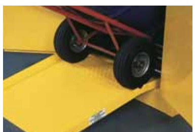
Drum Ramp 25932 fits all Justrite Drum Cabinets.

Extra Haz-Alert™ labels can be purchased separately for added visibility from different angles.