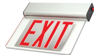
Double face utilizes a mylar insert